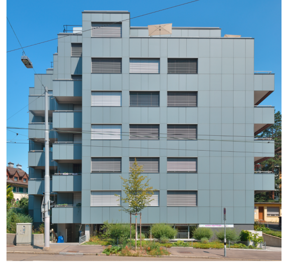
Fig. 1 Renovation in Zurich, Viriden+Partner.

Keywords: BIPV architectural integration; Renovation project; Active façade. Target audience: Regulation makers; Owners & other decision makers; Architects & engineers; Suppliers & companies; Broader public.