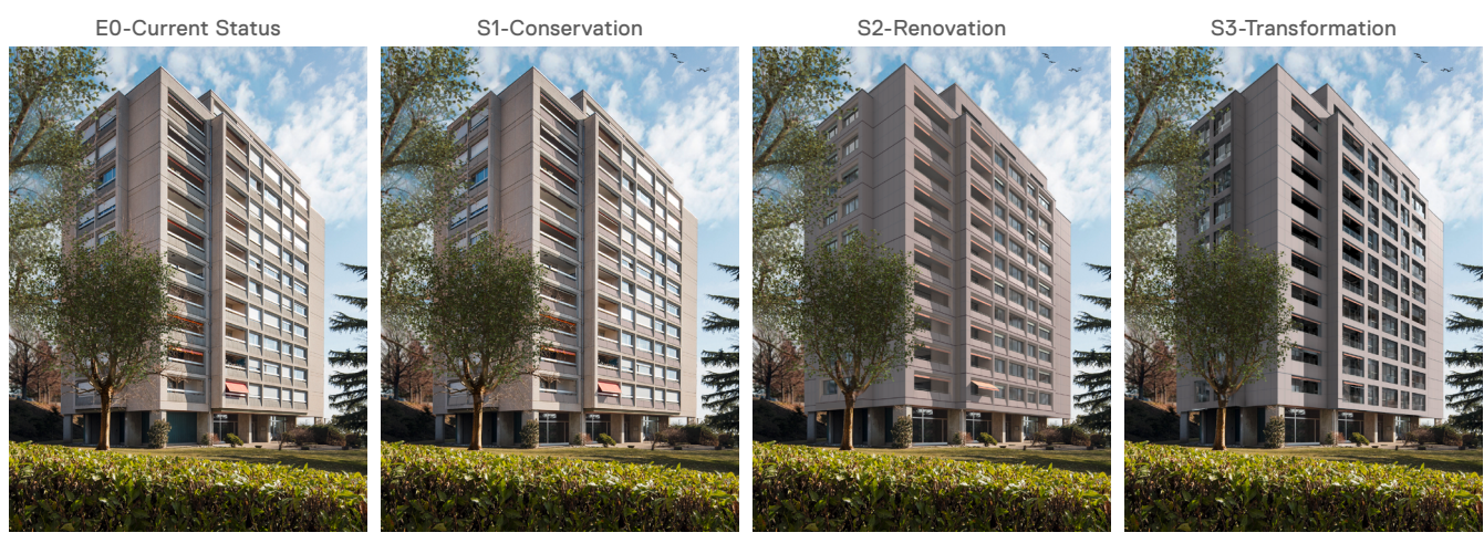
Fig. 2 Example of BIPV renovation scenarios proposed according to design and energy performance objectives [1].

S1-Conservation : This scenario aims to maintain the substance or expression of the building when possible (considering current practices) while improving its energy performance, by replacing defective elements with better performing ones: for instance, by changing windows, internal wall insulation and roof insulation. The highest performance is not necessarily achieved, because we want to respect the existing appearance of the building, but current legal requirements [2] should at least be achieved. In addition, unlike the baseline (S0, current practice), in this scenario (S1) we propose to respect the targets needed to obtain a subsidy of 60 CHF/m<sup>2</sup> from the "programme bâtiment" [3] which promotes energy renovation of existing building envelopes.