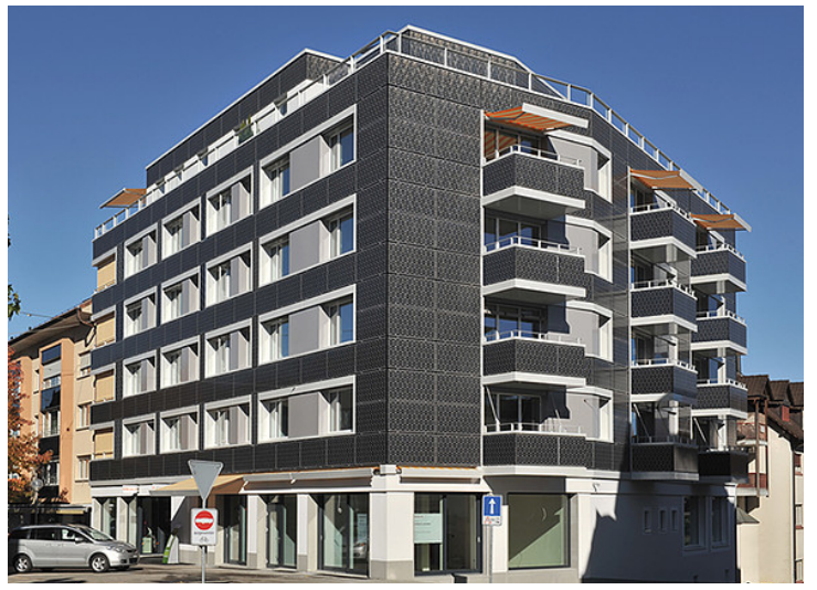
Fig. 2 Renovation of a residential building in Romanshorn (©Viriden + Partner).

We here present successful examples of renovated buildings with BIPV in Switzerland, in order to demonstrate the possibilities from an architectural perspective. The literature review shows that most BIPV studies and applications focus on commercial and office buildings [1,2], mainly because such buildings present less barriers to BIPV implementation due to (in general) the existence of an owner-occupant. There is in fact an insufficient number of aesthetically convincing exemplary buildings of residential renovation projects with BIPV. The few examples found are focused on singular or historical buildings (with a high level of heritage protection), such as churches or monuments [3]. Further examples can be found in [2,4], a large census of new construction projects, as well as in [1] for the most recent flagship projects.