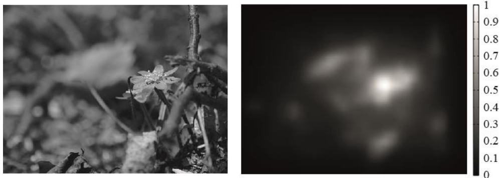
Figure 1. An example of the saliency map application. It is possible to use a photo as an import into the saliency map tool. The photo is considered to be a snapshot of the human visual scene. Even though the proportion of the Harel & Koch map's default setting is 900 x 1200 pixel, but in reality the proportion does not matter due to saccade movement in the human eyes.

the object is from the centre of the image (e.g. the leaf down-left), the more it tends to be suppressed.