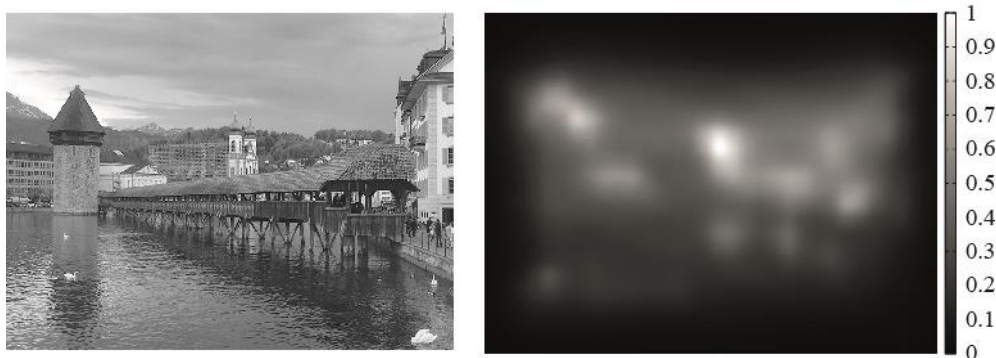
Figure 2. The image “as is” (left) and its saliency map “as is” (right).

In order to find out the visual changes and their corresponding quantified descriptions, representative heritage views was chosen for the investigation. Visual changes in this paper always referred to the difference of the view perception of the scene in figure 2 (“as is” situation) before and after the PV installation. Figure 2 shows the Kapellbrücke in Lucerne Old City as an application example because it could best demonstrate how a scenic view is very sensitive to an extrinsic PV installation that did not belong here originally. The sensitivity was also amplified by the fact that the PV was installed on a precious heritage building.