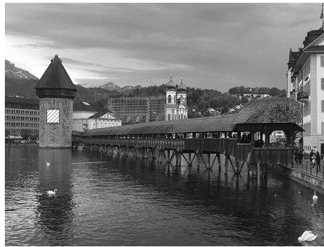
Figure 3. The white square represents the locations where Photovoltaics of different colors were added.

This paper studies the visual changes caused by differently coloured PV modules in this view, as purely hypothetical installations. A square PV module was painted into the image region showing the tower, indicated as the white square in figure 3. Other parameters than the colour such as location and details (joints, mounting, cables etc.) were omitted.